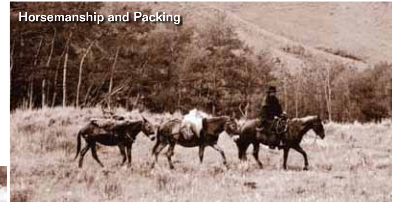
Horsemanship and Packing