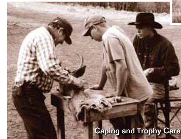
Capping and Trophy Care