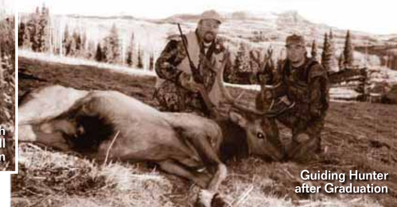
Guiding Hunter after Graduation