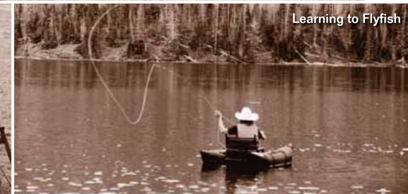
Learning to Flyfish