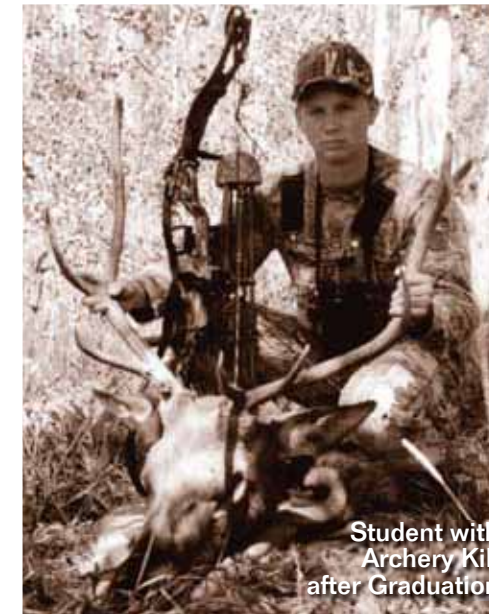
Student with Archery Kill after Graduation